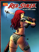
Cover A (160%) Wagner/Gonzalez